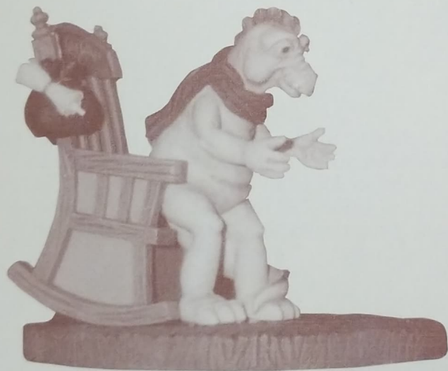
Come to Me