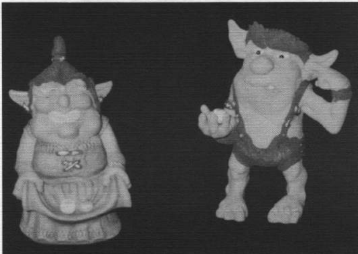
#1051–Grackene the Troll's Wife

Our lovely troll couple #1041–Groc, and #1051–Grackene. I'm sure they will appear again some day, who knows when or how? Also, with developments as they are, in the forth book (which is due out in the summer), #2101–Large N'Chakk is departing us. At the current time N'Borg couldn't be happier. We would suggest you contact your local dealer for these while they are available. They may order them as long as supplies last. I must go for now because I'm starting to cloud up. Boo-Hoo! for Groc and Grackene, and just Boo! for N'Chakk.