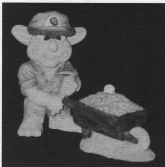
#506 – Twingnuk 6th Year Members Only Figurine

Welcome aboard for the next exciting Krystonia Club year.