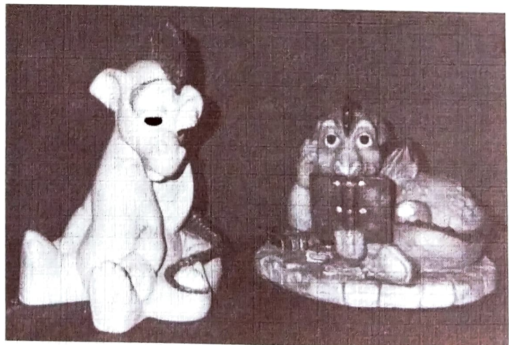
#1071 Owhey & #501 Pultzr